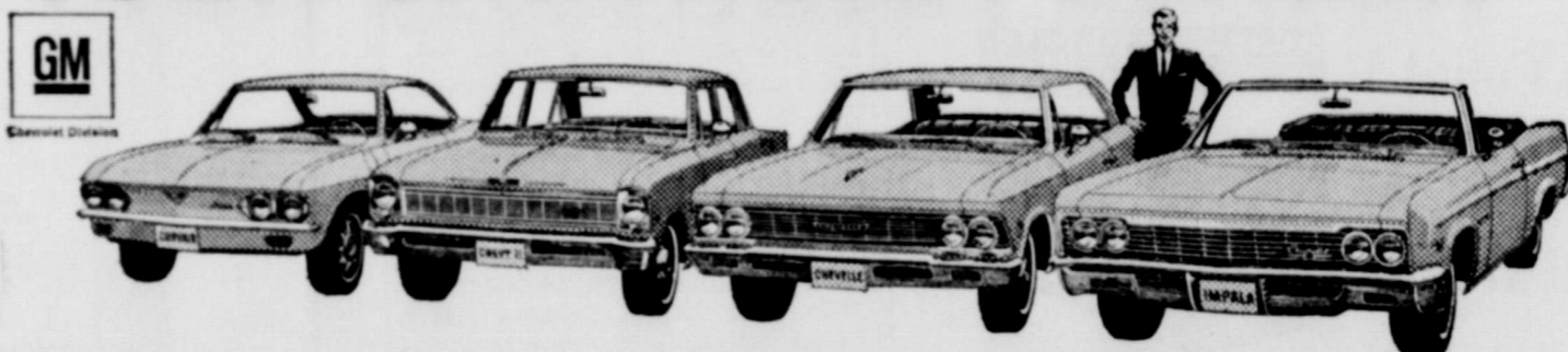
Left to right: Corvair Monza Sport Coupe, Chevy II Nova 4-Door Sedan, Chevelle Malibu Sport Coupe and Chevrolet Impala Convertible. Each comes with an outside rearview mirror and seven other standard features for your added safety. Always check your mirror before you pass.

That's the beauty of buying America's most popular make of car—especially right now when summer savings are extra tempting. It just makes sense that you're going to save in a big way by seeing the man who's doing business in a big way. So go see what