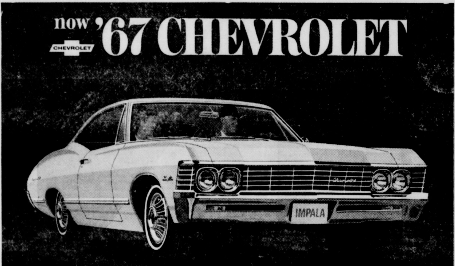
With an Impala Sport Coupe you can get all the comforts of home, maybe even more.