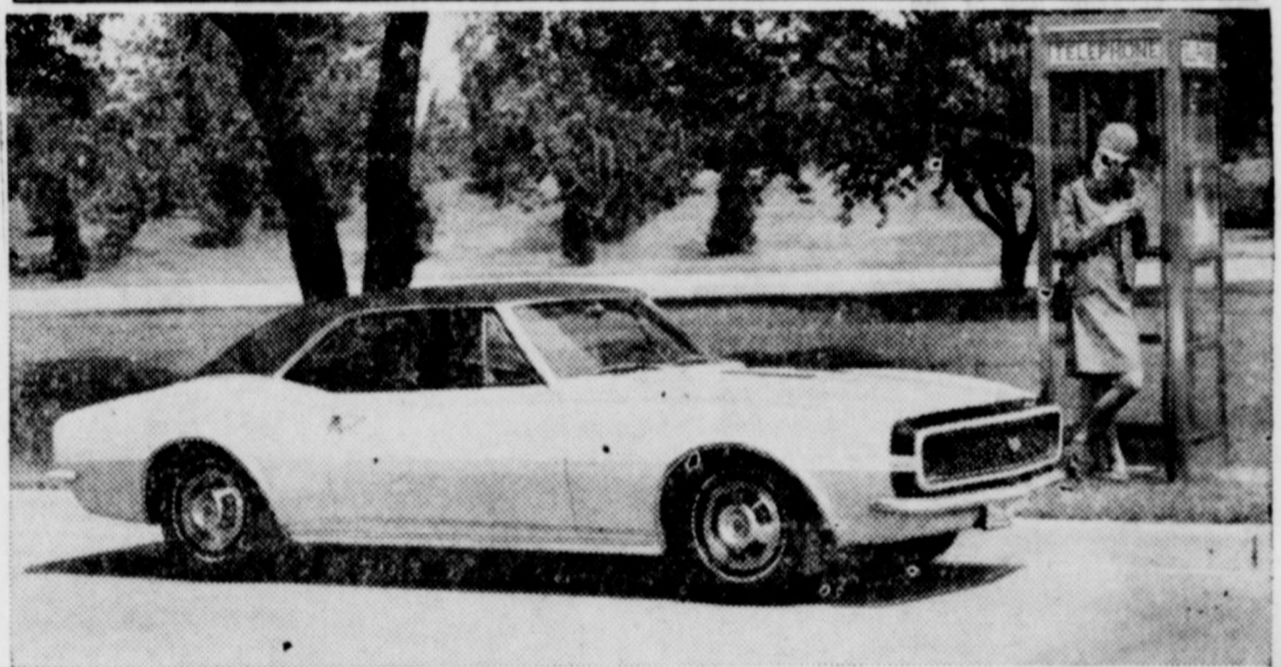
The all new CAMARO will be built in sport coupe and convertible models (Super Sport shown above). The Camaro line incorporates many sprightly options that include concealed headlamps behind a lattice grille which opens and closes when lights are turned on and off, plus a hood with simulated louvers and a wide "bumble bee" paint band on the nose. A 350-cu.-inch V8 engine is used in the Super Sport version of the CAMARO. They go on display September 29.