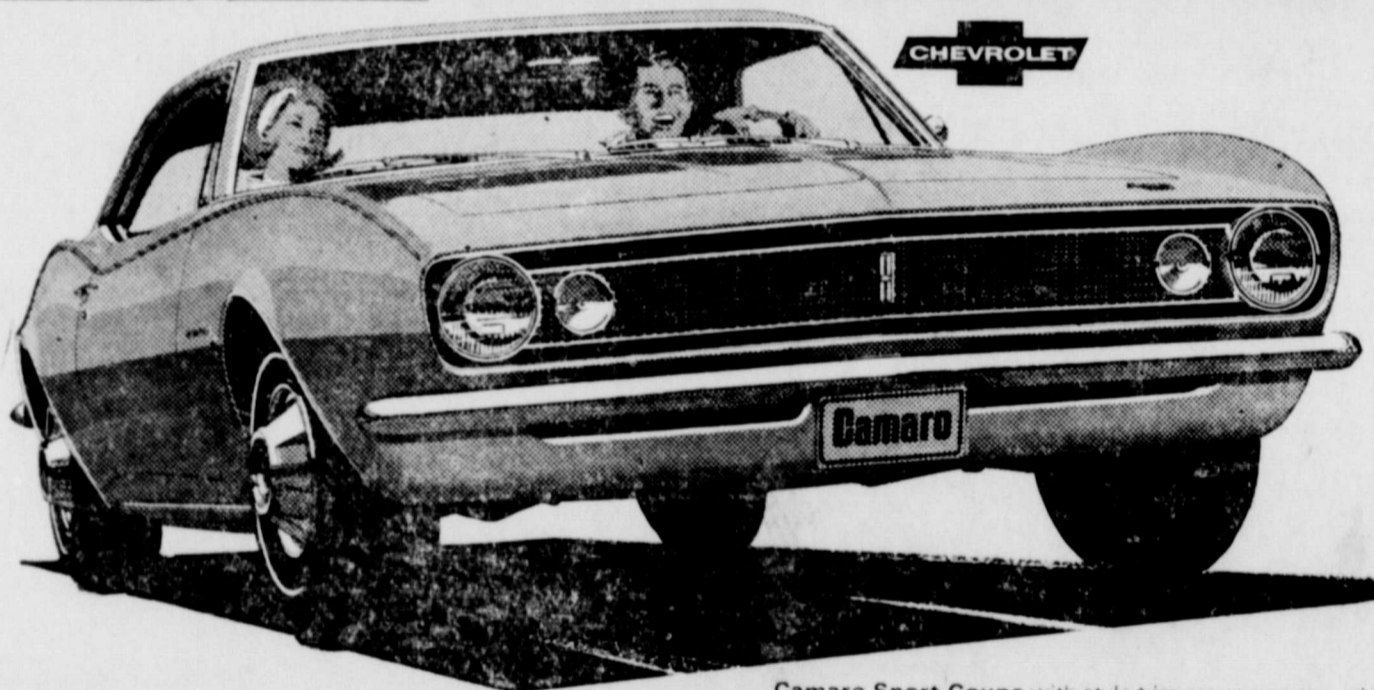
Camaro Sport Coupe with style trim group you can add.

You've been waiting for a Chevrolet like this. Now it's here.