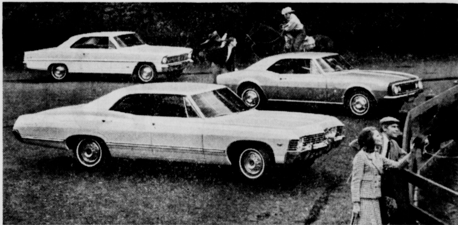
Top left: Chevy II Nova Sport Coupe. Foreground: Chevrolet Impala Sport Sedan. Top right: Camaro Sport Coupe.