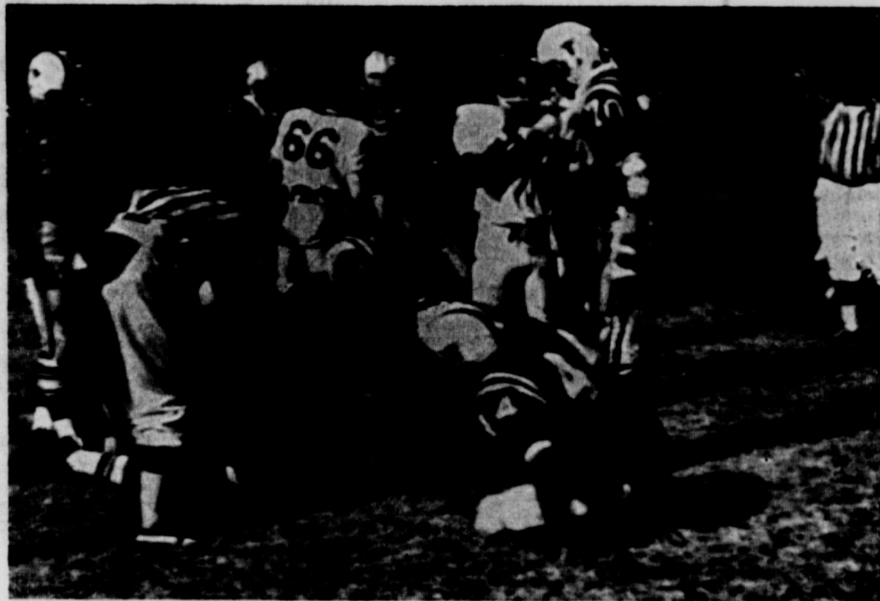
Tactics Like This by the Longhorns Ruined Wilson's Offense

A powerful Bronte Longhorn football team lived up to its boast of being the No. 1 Class B team in the state last Friday night when its members ripped by the Wilson Mustangs, 36-14, to win the Region 1 championship. The game was played at Tiger Stadium in Snyder.