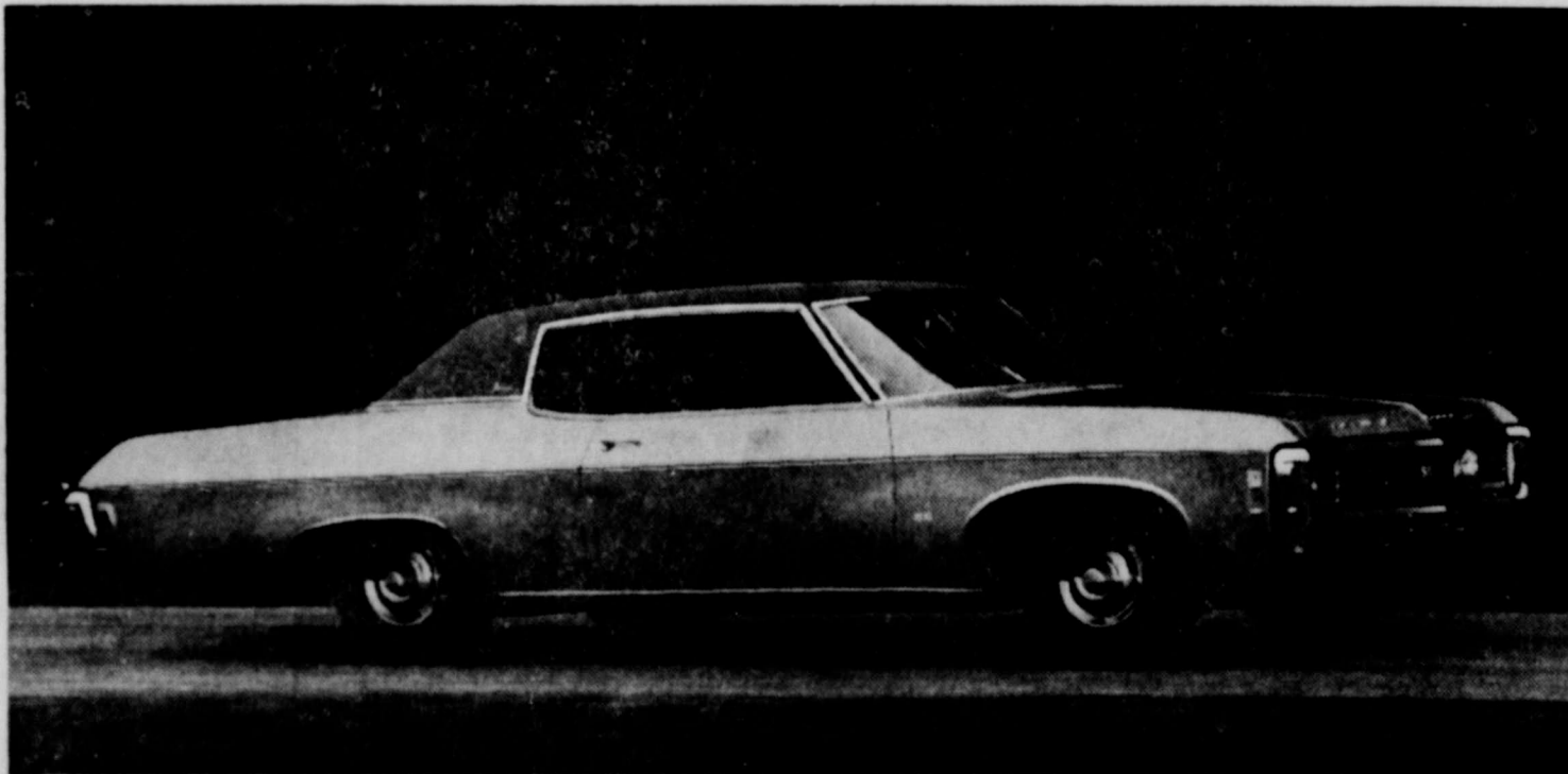
'69 Impala SS 427 Custom Coupe.

See the Super Sports at your Chevrolet dealer's Sports Department now.