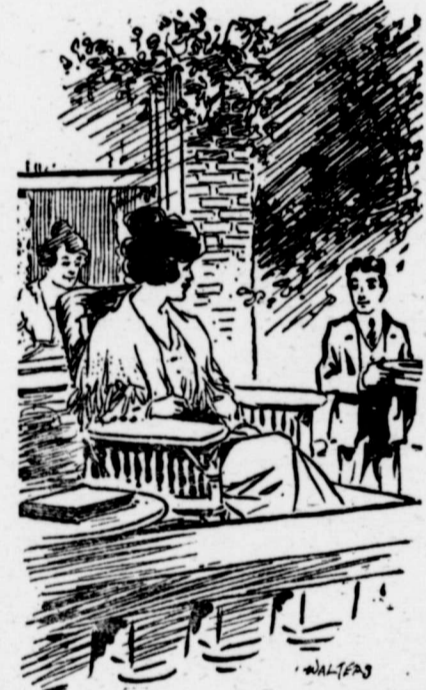
Raised His Hat and Passed By.