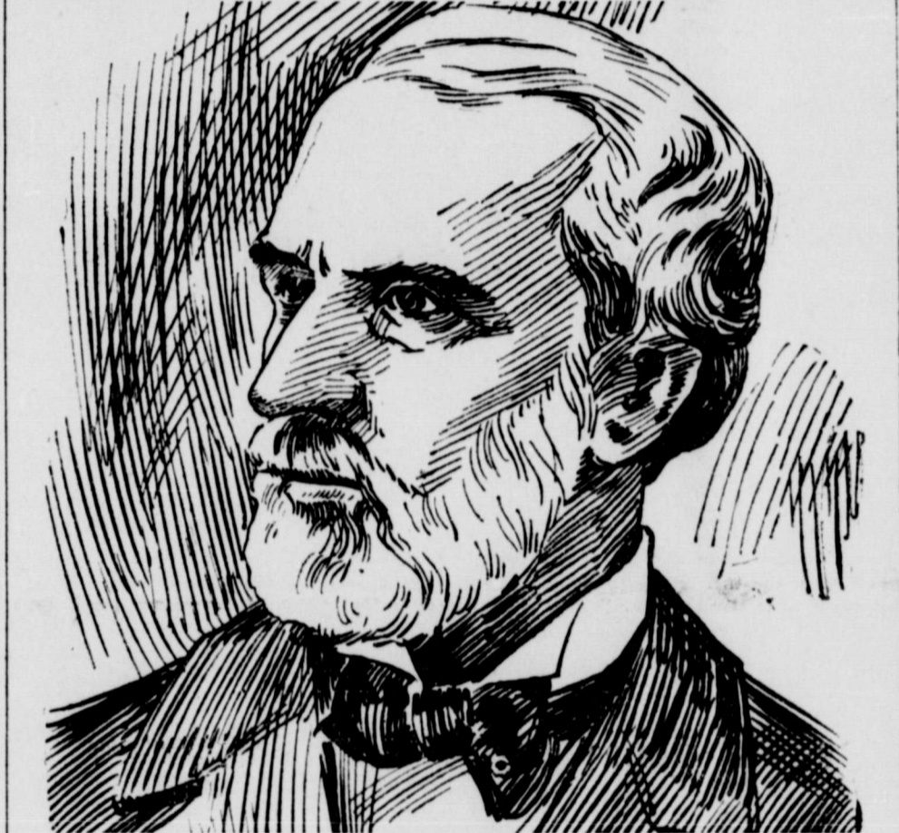
GEORGE W. JULIAN.

pear. Julian's experience there in combating the slave-owning influence was little different from that of Lovejoy in Illinois, except that he was not assassinated. His public meetings were routed, buildings stormed in which he was sheltered, and many times his life placed in peril.