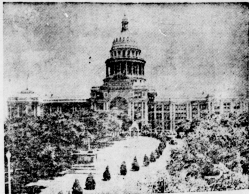
Largest and finest of all State capitols is that of the State of Texas in Austin. Constructed of Texas granite, its dome reaching seven feet higher than the national capitol in Washington, the Lone Star capitol is being visited daily by Centennial visitors from all sections of the country. Texas paid for its magnificent building a half century ago with three million acres of its far-flung domain.