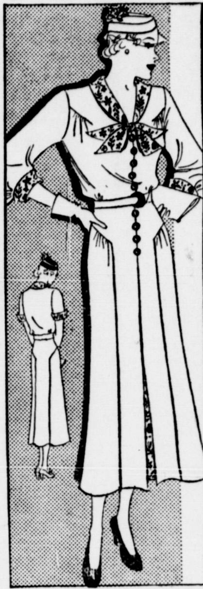
Pattern No. 1851-B The smartest of the new dresses are those in a single color with flashes of printed silk to trim them. This design is one of the

best, made of blue cloxy silk and trimmed with a print in red and blue on a white ground. The front of the oodice has a row of buttons extending to the hipline and a collar of the printed silk. A slender, panelled skirt is split up the front to show a printed strip that is at-