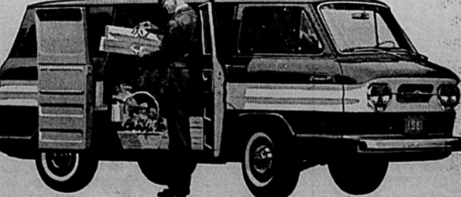
CORVAIR—Side doors open a full 49" wide. Loading height is a low 14" BEE

A panel and two pickups that put a thrifty air-cooled engine in the rear, the driver up front and as much as 1,900 pounds of load space in between! That's more capacity than a conventional half-tonner. Yet these Corvaire 95's are nearly two feet shorter from bumper to bumper. Highly maneuverable. Built to last and bound to save on a busy schedule!