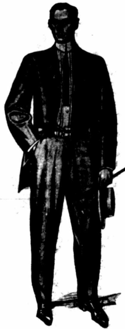
DESIGNED BY SPERO, MICHAEL & SON NEW YORK

Men's Wool Shirts from 75c up to $1.80 Heavy fleeced lined Underwear 50c grade 39c Better Underwear 43c Heavy Wool Sox 19c