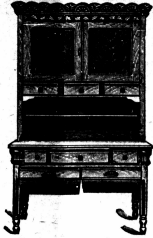
From $5.00 to $15.00

Besides the money you will save by buying here will pay for another, thus giving you absolutely free two of these Handsome Rockers. Why go elsewhere when you can do so much better here? Think it over, neighbor.