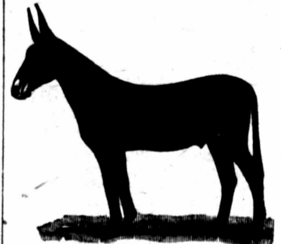
JOE , Mammoth and Spanish jack, the biggest and best jack in the country.

Will be careful to prevent accidents, but not responsible should any occur.