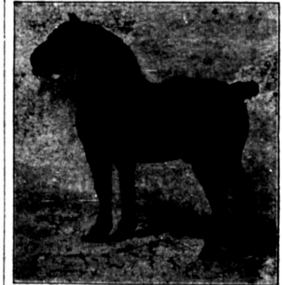
KERMET , black Percheron, sired by Chevalier No. 46774, imported in 1897; dam sire, Majellan No. 10442, imported in 1885.

I will stand the following animals this season at my place, 5 1/2 miles southeast of Portales, each day of the week except Saturday, and on Saturday at Jones & Servis' barn in Portales: