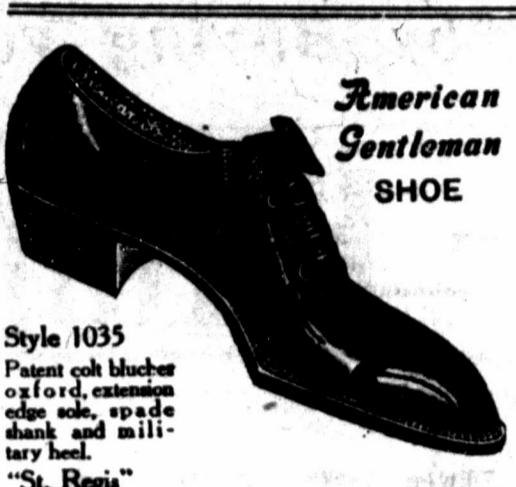
Style 1035 Patent colt blucher oxford, extension edge sole, up-side shank and military heel. "St. Regis" Toe $2.50 to $3.50