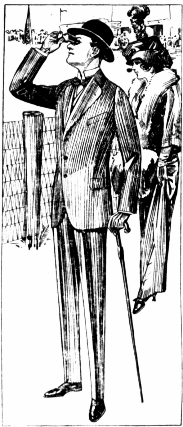
SCHLOSS BALTIMORE CLOTHES

You'll wonder when you see them, how we were able to get such splendid fabrics these war times for, as everyone knows, honest sturdy woollens are hard to get, right now.