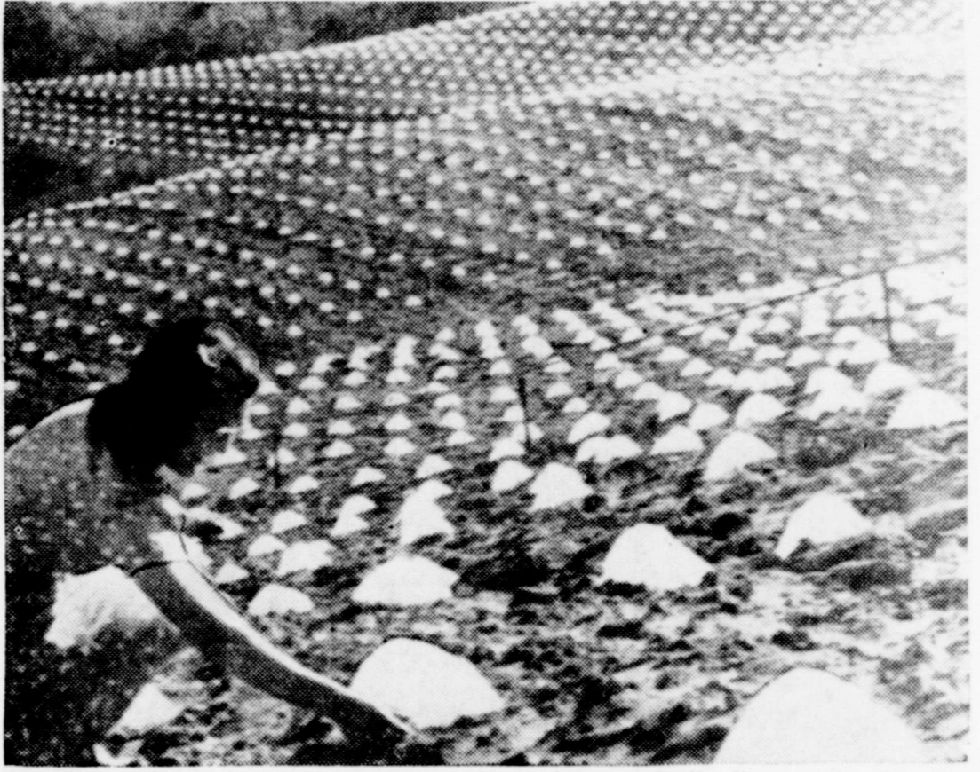
On 90th day of upper New York state drought threatening crops, Pauline Warner, helps place paper "hats" over 5,000 melon plants near Albany to protect them from sun's rays. Temperature in New York City soared to 90.7 degrees.