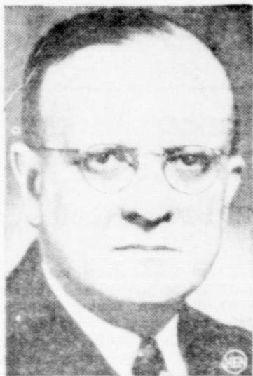
Clarence E. Gauss, above, new United States ambassador to China, arrived at Chungking so far ahead of schedule that most of the officials who planned to greet him were not on hand.