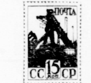
Soviet Stamps Mark Industrial Gains

SOVIET Russia's industrial and agricultural advances are commemorated by a special issue of seven stamps. The blast furnace, pictured on the stamp above, honors iron and steel production, now four times that of the country's pre-World War total.