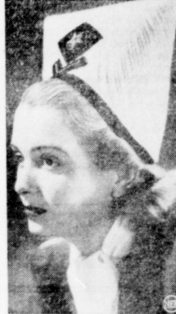
Movie Star Jeanne Kelly gets marine minded with white bonnet of stitched cotton with nautical trimming in navy blue and gold.