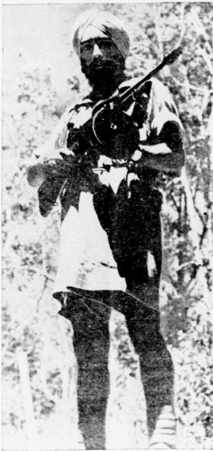
This tall, dark and fearsome fighter is a fine example of the Sikh troops from India now manning the defenses of vital Singapore with Anzacs and other British empire soldiers.