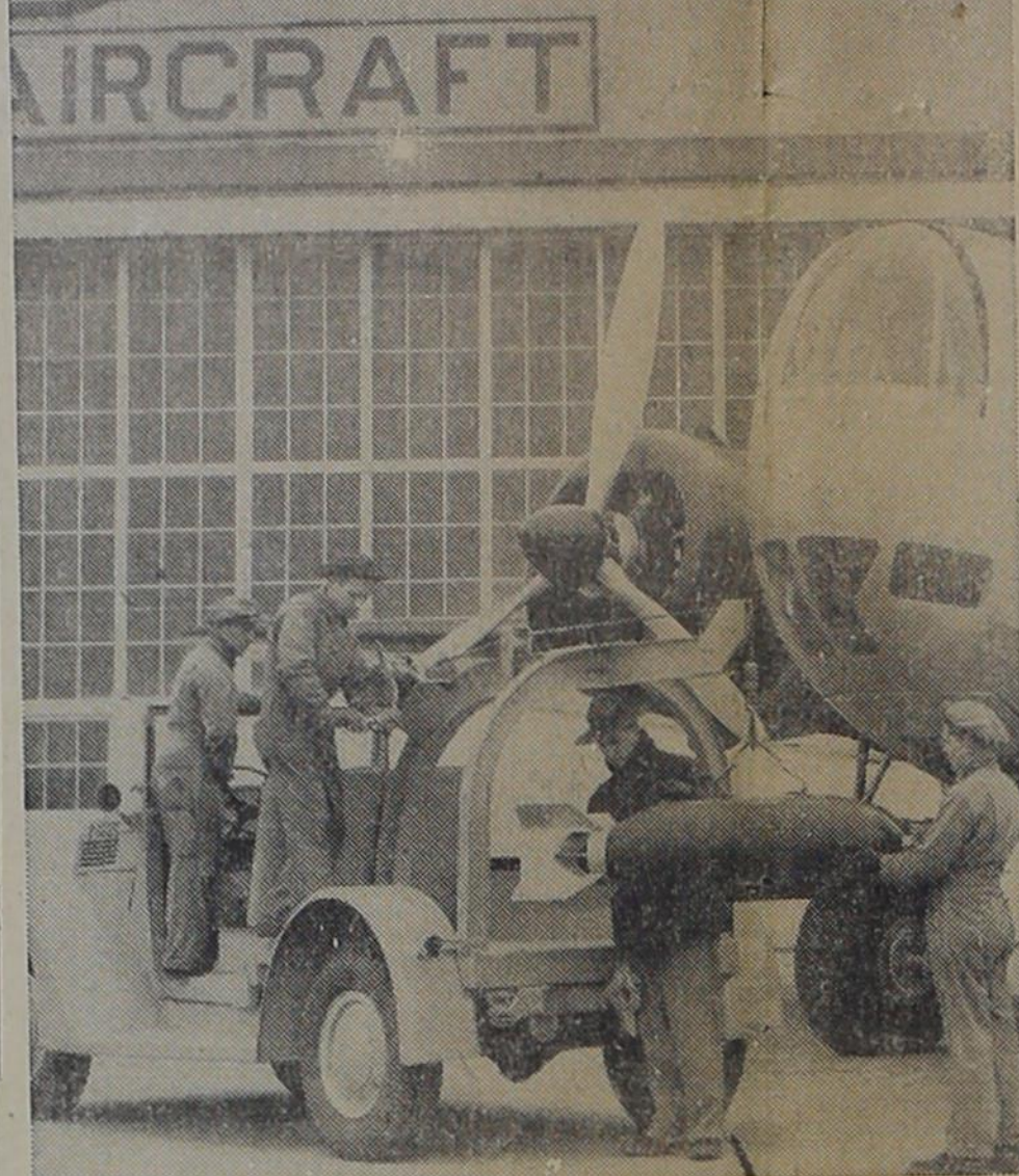
SELFLEDGE FIELD, Mich.—A familiar piece of motorized equipment around U. S. Army Air Corps bases these days is this bomb service truck, shown being demonstrated near a big bomber plane at Selfledge Field. Manufactured by the Ford Motor Company, the truck is rigged with special derrick and winch to handle bombs weighing 600 to 1,200 pounds. The bomb in the photo is a dummy 600-pounder used for training purposes.