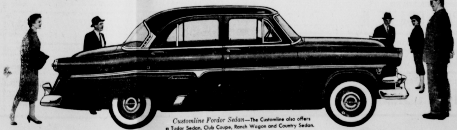
Customline Fordor Sedan—The Customline also offers a Tudor Sedan, Club Coupe, Ranch Wagon and Country Sedan.

We cordially invite you to Test Drive Ford ... America's "Worth More" Car