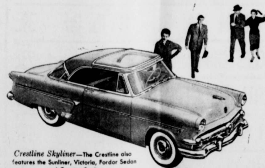
Crestline Skyliner—The Crestline also features the Sunliner, Victoria, Fordor Sedan and Country Squire.

With 28 new models... 2 new deep-block engines... all the optional power assists* of costliest cars... the 1954 Ford is fast becoming America's favorite.