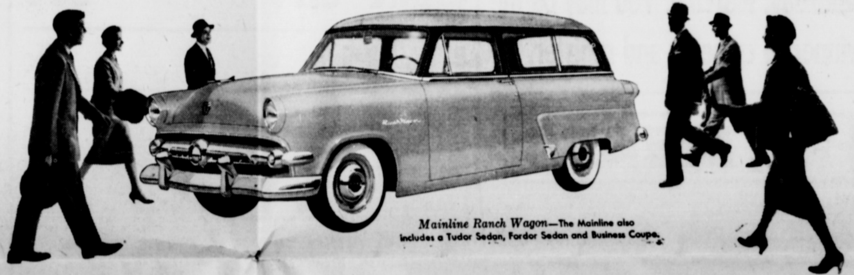
Mainline Ranch Wagon—The Mainline also includes a Tudor Sedan, Fordor Sedan and Business Coupe.

Most Antarctic explorers have been English.