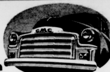
Be careful - drive safely