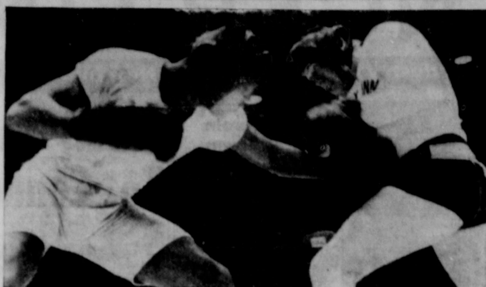
HE'S NO CLAY PIGEON—Ingemar Johansson trains in Miami Beach for his upcoming fight with Floyd Patterson. His sparring partner is Olympic boxing champ Cassius Clay

SUNNYDALE REST HOME 211 West Fifth St. Breckenridge 24-hour care for elderly or convalescent men or women. Private and semi-private rooms. Bedfast or ambulatory patients. Excellent meals—clean—comfortable—reasonable rates. Visit Us, Write P. O. Box 90, or Call Hickman 9-3990 Collect For Further Information