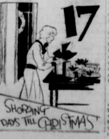
SHOPPING DAYS TILL CHRISTMAS

JACKSONVILLE, Fla., Dec. 4.—Smoldering debris is all that is left of a block of the river front town after a spectacular fire saw warehouses causing damages estimated at $500,000 and minor injuries to several firemen and spectators.