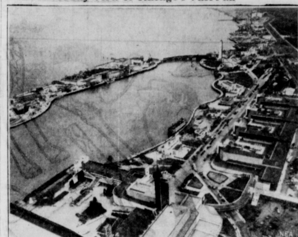
Here is the striking panorama of Chicago's Century of Progress, viewed from the western shore of the Sky Ride. The fair's marvels extend along the shore and cover the man-made island at the left.