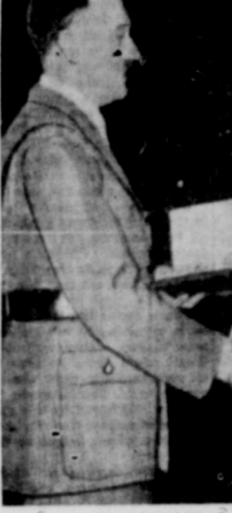
Much be-medaled Marshal Hermann Goering had two more decorations to add to his collection after scene pictured above. Führer Adolf Hitler gives chief of Nazi air force congratulatory handshake at Berlin ceremony in which Marshal Goering was awarded Grand Cross and Iron Cross for his part in swift subjection of Poland.