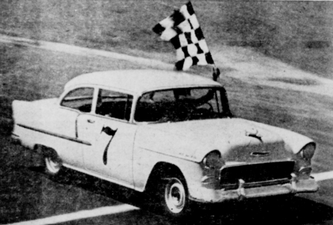
Great Features back up Chevrolet Performance: Anti-Dive Braking—Ball-Race Steering—Out-rigger Rear Springs—Body by Fisher—12-Volt Electrical System—Nine Engine-Drive Choices.

Let's translate these victories into your kind of driving. You've got to have faster acceleration to win on the tracks. And that means safer passing on the highways. You've got to have better springing and suspension. For you: safer and happier motoring. You've got to have big, fast-acting brakes and easy, accurate steering. More things that make your driving safer! Come in and drive a Chevrolet yourself. Every checkered flag signals a Chevrolet victory in official 1955 stock car competition—not only against its own field but against many American and foreign high-priced cars, too!