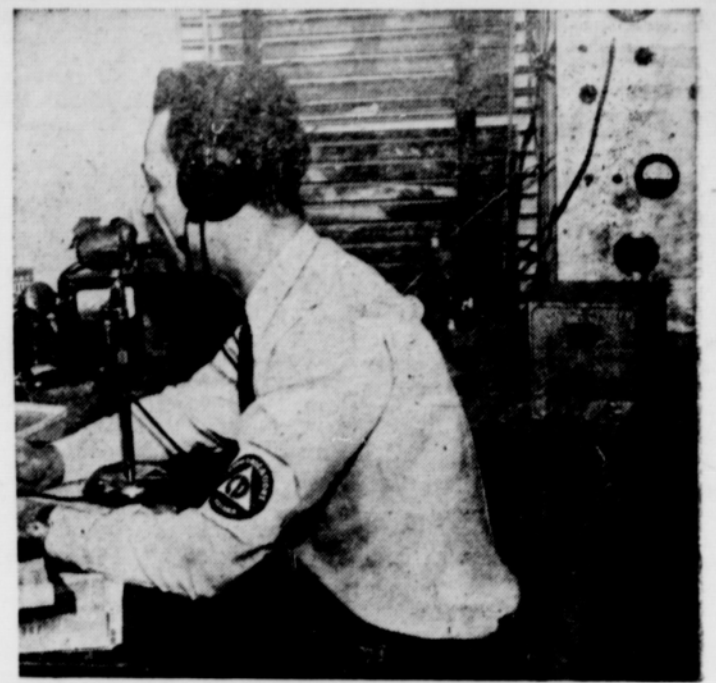
AMATEUR RADIO "hams" play a key role in alerting civil defense units to natural disasters, and maintaining vital communications when telephone lines are down. This Marion, Ind., operator flashed the first word of that city's tornado to Indiana civil defense headquarters, which immediately rushed aid. Most "ham" operators are linked to civil defense through the Radio Amateur Civil Emergency Service, sponsored by the Federal Civil Defense Administration to supplement regular channels.