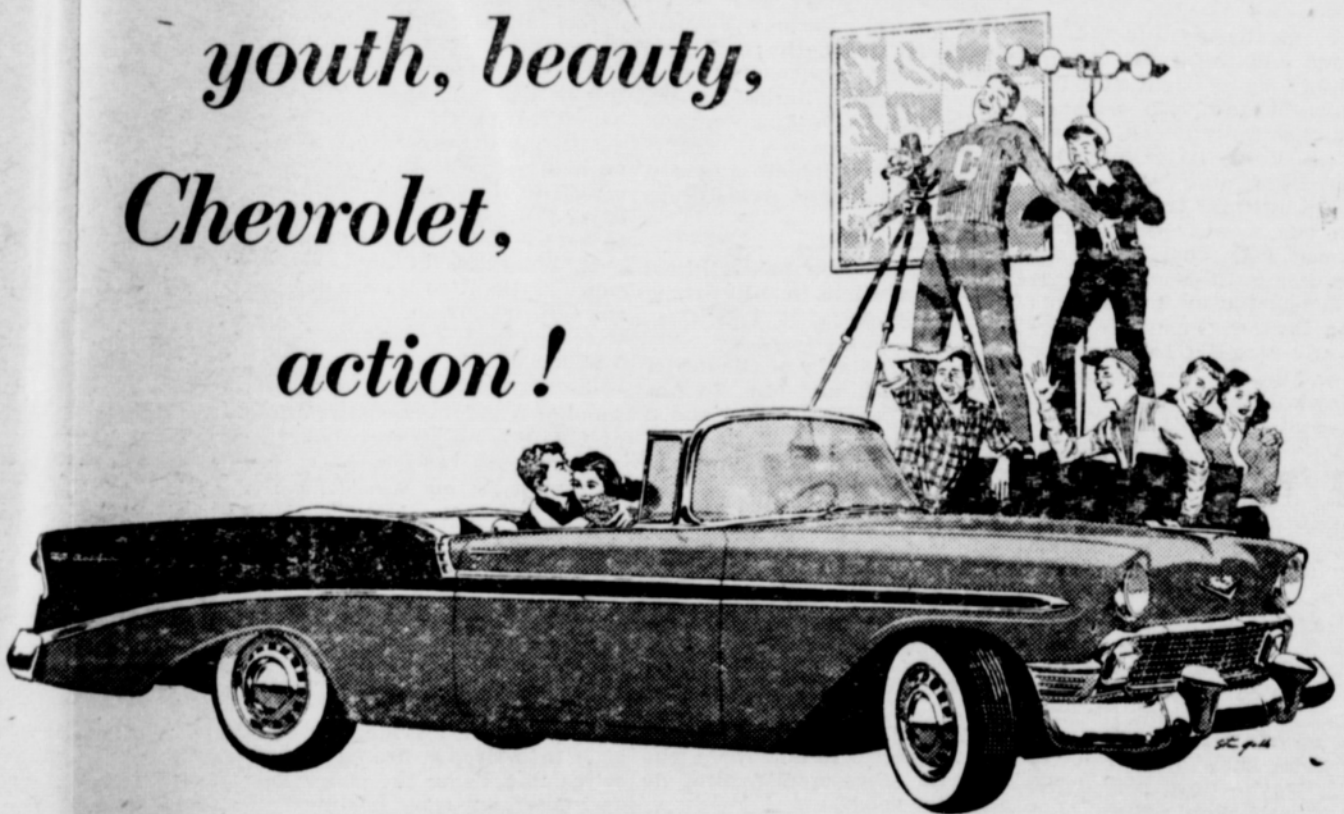
The new Bel Air Convertible—one of 20 sassy-styled new Chevrolets.

Want to take the wheel of one of America's few great road cars? Want to send pleasant little tingles up and down your spine? Then hustle on in and try out a new Chevrolet V8!