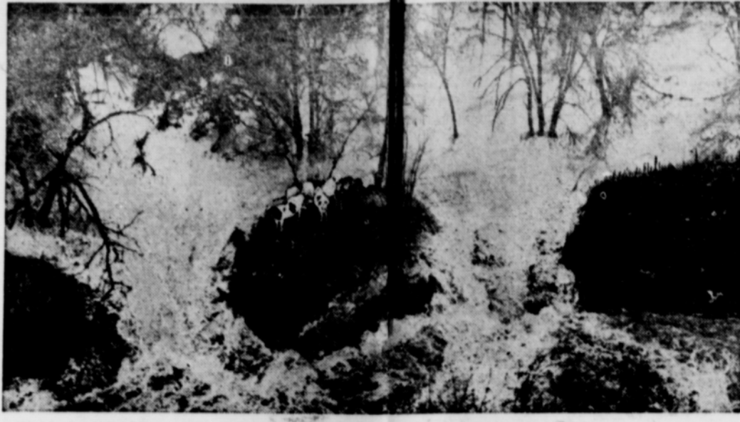
RURAL RAMPAGE results as the Feather River cuts through a secondary levee near Nicolaus, Calif., during floods which inundated rich farmland and drowned much livestock. Federal disaster funds, administered by the Federal Civil Defense Administration, were poured into the stricken area to restore vital public facilities such as bridges, hospitals, highways, water and sewer systems.