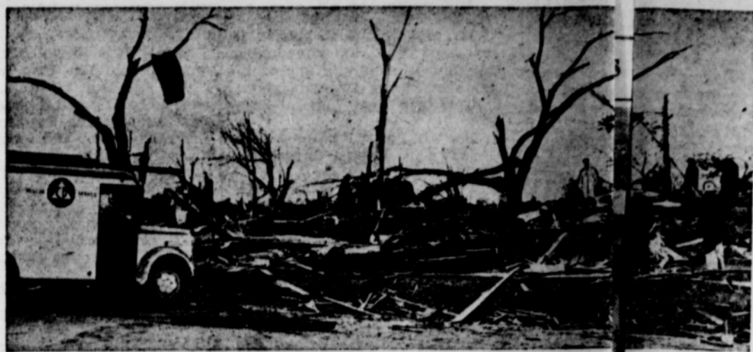
CONCENTRATED FURY of a tornado is unmatched among all natural disasters. Here civil defense workers search among the debris of Udall, Kan., for some of the 24 dead and hundreds injured by the twister on the night of May 25, 1955. Special cutting and lifting equipment of the civil defense "Calamity Jane" rescue truck at left enabled them to rescue many victims trapped by rubble who might otherwise have died in the first hours.