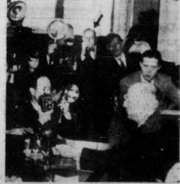
Appearing before the Senate Foreign Affairs committee today, Secretary of State James Byrnes tells the committee that Patrick J. Hurley's charges against U. S. Career diplomats in China were without foundation. Hurley, who in his testimony before the committee yesterday said that the U. S. policy in China was being sabotaged, watches Brynes from behind cameramen, (indicated with arrow).