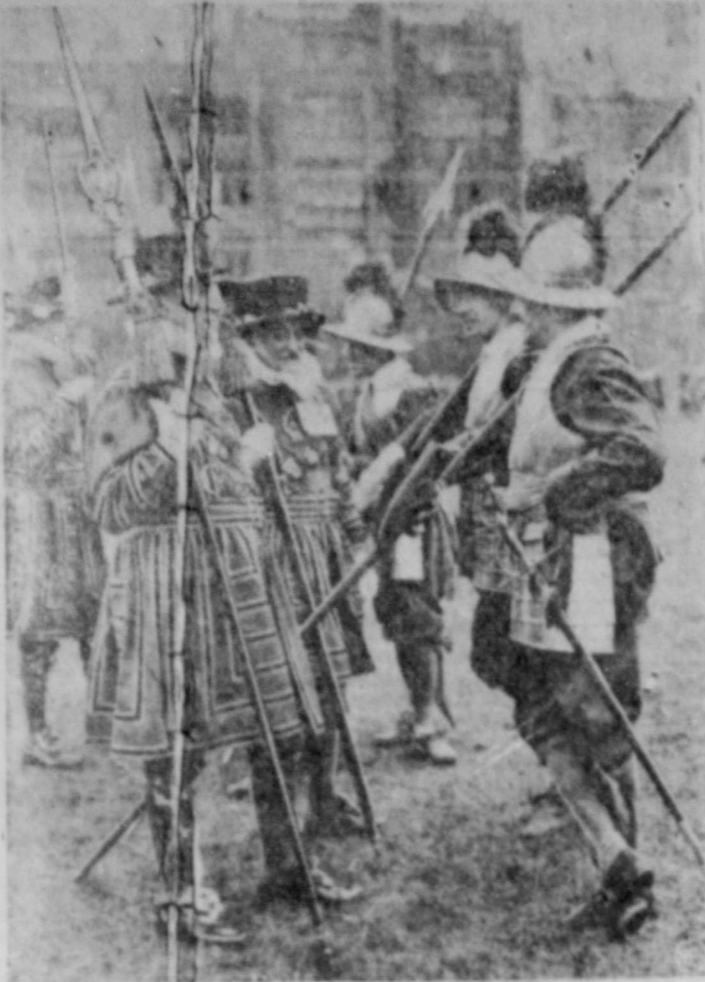
It's back to the plumed hats and pikes for the men of Britain's fancy dress units, many of whom served in the armed forces during the war.