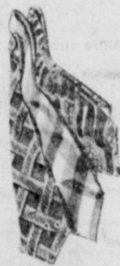
Wool and Rayon MUFFLERS

Christmas is too joyous a day to allow its memory to fade... Keep it bright throughout the year with Gifts from JOSEPH'S