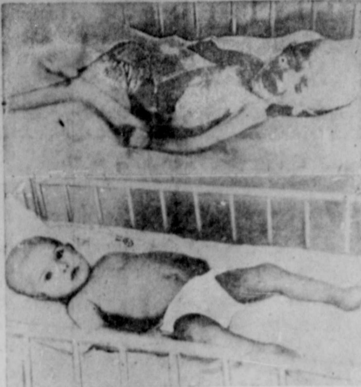
Three months of proper care under UNRRA supervision resulted in the almost incredible transformation in the infant shown in the photos above. Top picture was made when the 8-month-old baby was liberated last July from a Nazi concentration camp. UNRRA took charge and removed the infant to Sweden, where the bottom photo was made in October.