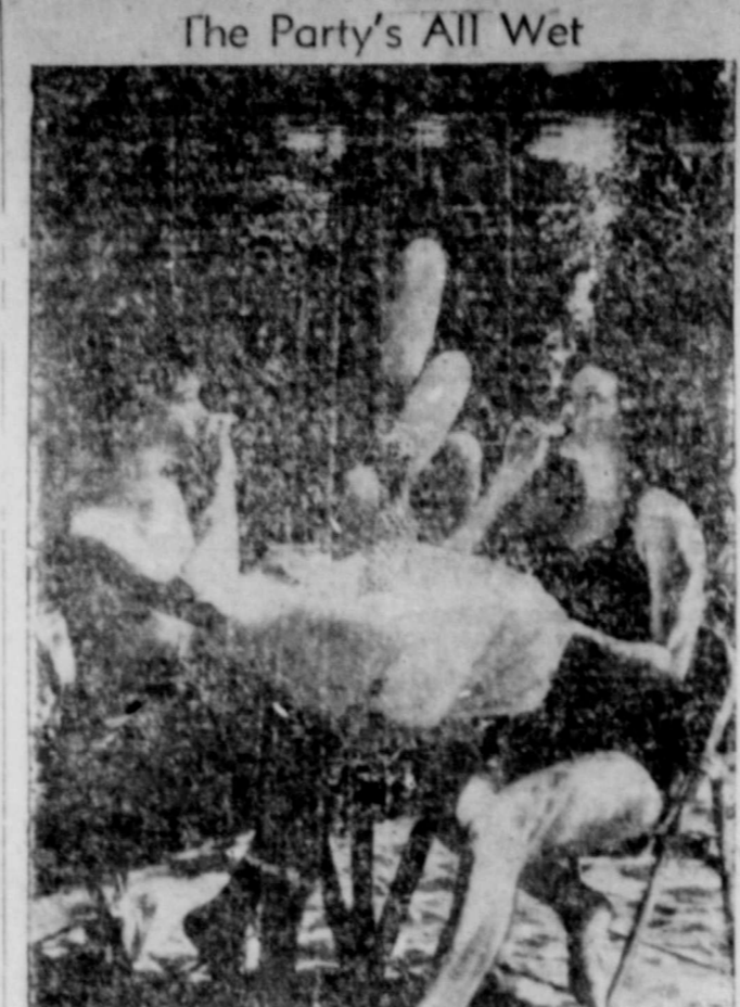
Lifeguards Carl Heller and Hazel Day hold their New Year's party where the only party crashers would be porpoises, octopi or founder. They're having a gay time on the floor of Florida's Silver Springs, with no one able to put a damper on the festivities.

The Party's All Wet 3. Keep the tree indoors as short a time as possible, with the base always under water. The water will have to be replenished frequently if the absorption is active. 4. Place the tree away from radiators, powerful electric lights, radiators or other sources of heat, and avoid the use of candles. Keep tinsel and other metallic decorations away from light sockets. 5. Remove accumulations of Christmas wrappings, and use only artificial "snow" and decorations of the flame-proof or non-burnable type. 6. Check wiring for defects and loose sockets. Turn off the lights when no one is to be in the room for any length of time. If too many tree light circuits in one outlet over load the house wiring and blow a fuse, try other outlets. Never substitute a penny or an oversized fuse. 7. In all places of public assembly, place trees away from exits and station fire extinguishers or water pails nearby. In homes, a pail of water should be kept handy. 8. Dispose of old trees in fire-safe areas outdoors, because the trees burn with almost explosive violence. Does It Hurt Hard Way CARLSBAD, N. M., (UP)—Bill Lewis, state policeman, took the roundabout way to radio from his car to Officer C. S. McCasland, in another state police car, 100 miles away. A station at Searborn, Mo., 200 miles away, picked up the message and relayed it when interference kept them from making direct contact.