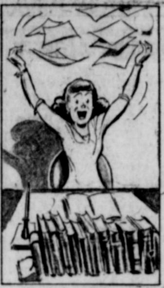
Kids out! Kids out! Teachers join the cheers, For the months they won't see the little dears.