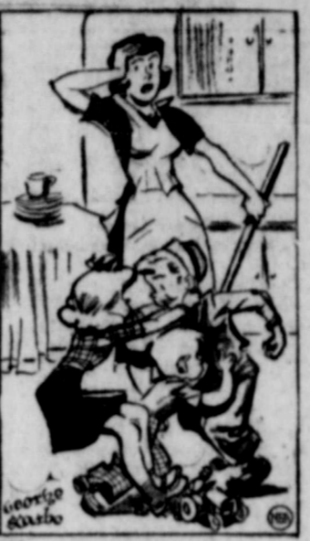
Worn out! Worn out! Parents all but bow, As they think how long it is until next fall.