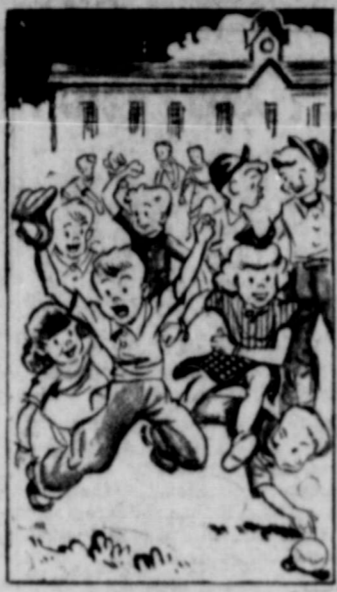
School's out! School's out! Comes the joyous yell - And the joyful children Greet that final bell.