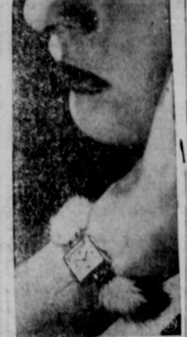
FUR A CHANGE—The ordinary wristwatch is going formal these days. This number, featured in New York, comes dressed up in a swank band of emine.

Bowling Briefs By winning two from the McKeever's, the Walker team gained a game on the League leaders in Tuesday night's bowling at the Ranger Bowling Lounge.