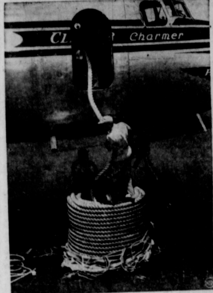
HAND IS QUICKER... —Cargo men on a commercial airlines plane work out a new twist on the old Indian rope trick.