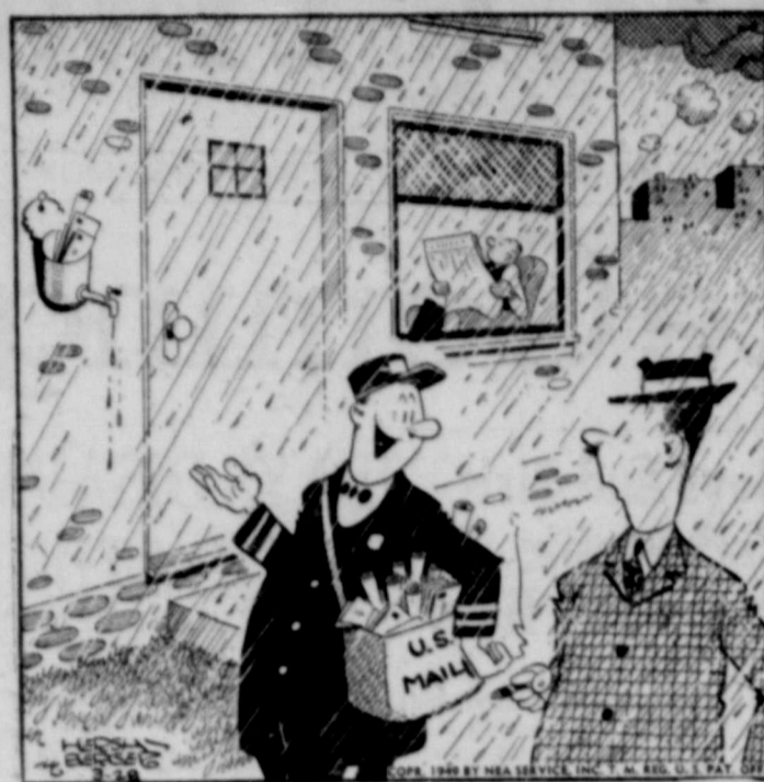
"MacTavish refuses to buy a mailbox!"