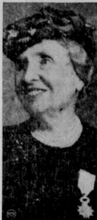
HELEN KELLER HONORED—America's Helen Keller, 72, proudly wears the Cross of the Legion of Honor, presented to her by President Vincent Auriol, of France. The blind and deaf woman is world-famous for her work in behalf of handicapped people.