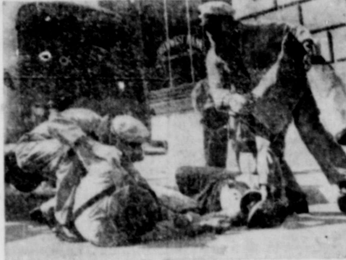
Top—Randolph Scott and Patricia Wymore share the action and romance of "The Man Behind the Gun," Warner Bros. new Technicolor outdoor production, due Sunday at the Tower Theatre. Story of the Cavalry's fight against banditry in early California.