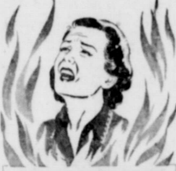
How Lydia Pinkham's works It acts through a woman's sympathetic nervous system to give relief from the "hot flashes" and other functionally-caused distresses of "change of life."