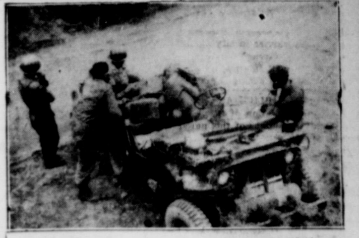
FAST COMMUNICATIONS are the difference between ineffective firepower and killing power, and the Reds are striving desperately to copy the U.S. system. Here a radio team directs artillery fire on Communist positions in Korea.

husband cuts-for-her in the surrounding woods. Bird lovers from all parts of northern New York come to view her collection. The hobby, she adds, has developed into a profitable gift business.