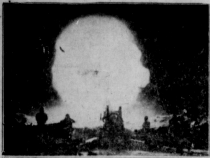
NIGHT ACTION! A 153-millimeter howitzer in Korea fires on Communist positions. Superior weapons such as this, manned by highly trained soldiers, have given American divisions a decided advantage over the Reds in killing power.