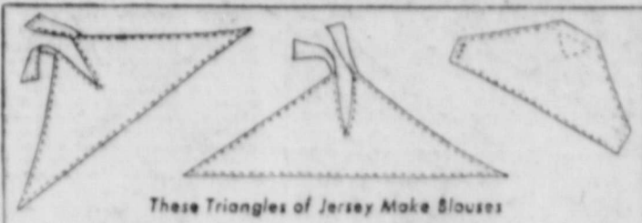
These Triangles of Jersey Make Blouses