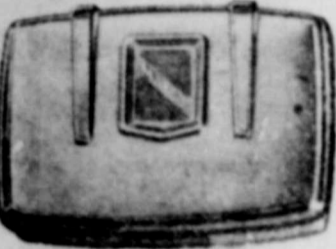
ONE "ENERGY CAPSULE" REPLACES BATTERIES