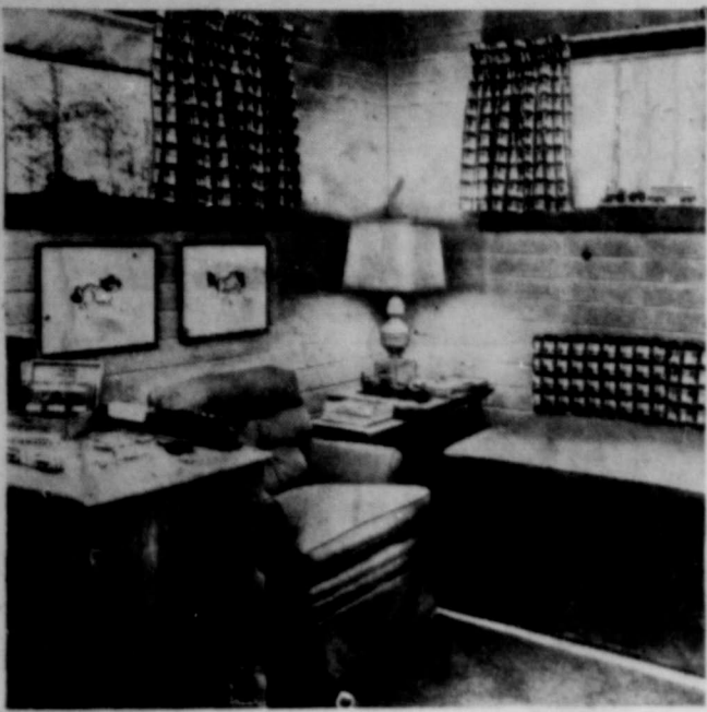
WHAT YOUNG MAN-OF-THE-HOUSE wouldn't thrill at bringing school chums home to a room like this? The whole decorating scheme revolves about a boy's interests. Shoulder high panel windows, fitted with thermopane insulating glass, give privacy and permit extra space for furniture placement, a plus item so welcome with today's smaller bedrooms.