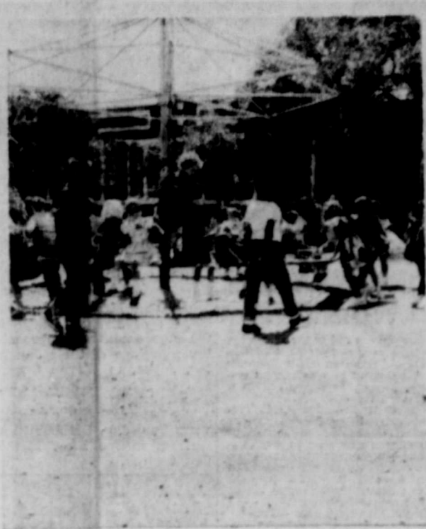
HODGES OAK PARK