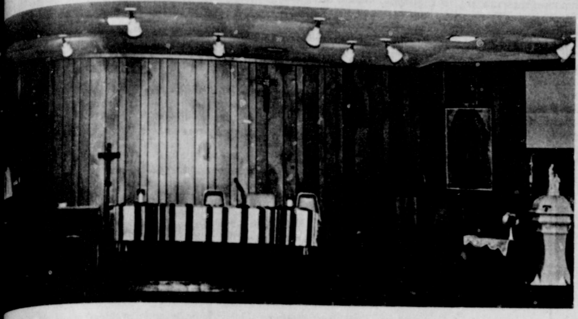
REMODELED sanctuary of San Jose Catholic Church in Lockney will be blessed Sunday during a special mass at 4:30 p.m.

Volume 78 Lockney (Floyd County) Texas 79241 Sunday, Aug. 26, 1979 16 Pages In Two Sections No. 68