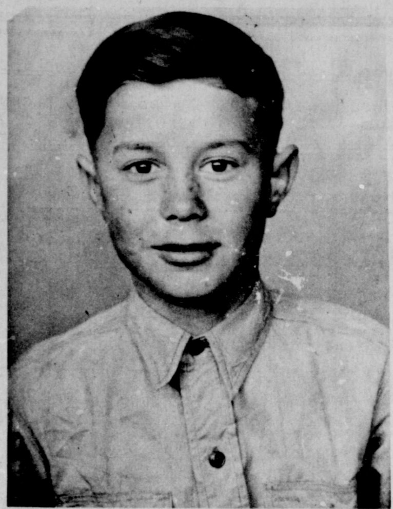
Lockney And Floydada Whozit . . . This fellow should be known in both Lockney and Floydada . . . . .

No one should have any trouble deciding the name of this young man. This picture was made at South Plains in 1942. If you are from Floydada and think this boy looks familiar—he does. He's a graduate of FHS.