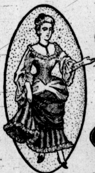
WITH THE CHARACTER OF THE WOMAN