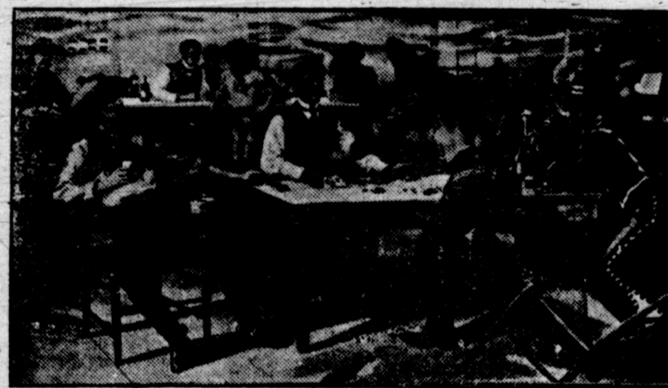
SCENE IN ACT TWO