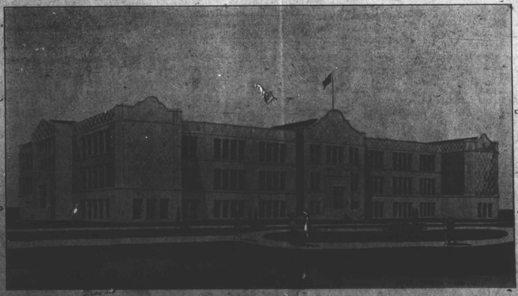
THE NEW BUILDING OF THE WEST TEXAS STATE NORMAL.