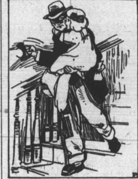
WHERE ARE YOU GOING NOW? SHE ASKED.

"Is your father at home, kid?" He was not altogether an unpleasant looking man who addressed the question to a fair haired child alone on the veranda of a suburban villa late in the afternoon of the day before Christmas. The little girl stopped playing, frowned prettily and answered: "My name's Muriel, not kid, and my papa never gets home till long after I've gone to bed. What's your name?" The hulking fellow averted his eyes and answered her question by asking another. "Who else lives with you?" "Oh, my little brother—you haven't seen him, have you?—my mamma and Mary. Mary's the servant, you know." "Good day, young 'un," said the tramp as he ambled away. "Muriel I'm called!" she shouted after him. "Will you come again?" "Thank'ee; I reckon I will," he answered. "Oh, wait a minute, papa; I'm so sleepy!" Muriel knelt up in her little bed, rubbed her eyes and shook her golden curls out. It was midnight. Having