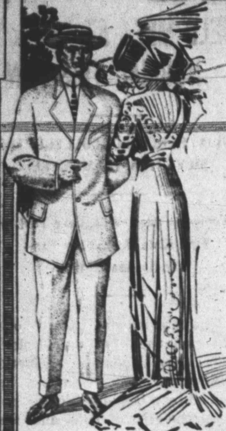
THE LEADER, Canyon City, Tex.

Yes, unless you allow yourself regular relaxation from your work. And when you do relax nothing contributes more to a keen sense of enjoyment than to "change clothes." Kind of makes a fellow "feel his oats." And in this day we all instinctively pay homage to the well-groomed man. Just now, with the Spring season at hand, is the natural time to select clothes. We have anticipated your needs with scores of new patterns in "Spring-like" effects—and styles created by Goldman-Beckman Co., at Cincinnati. Letter not put off coming until "the other fellow gets just the suit you wanted."