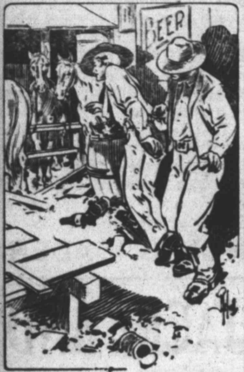
"Land's Sake, You Doan Mean to Steal Dem Horses?"