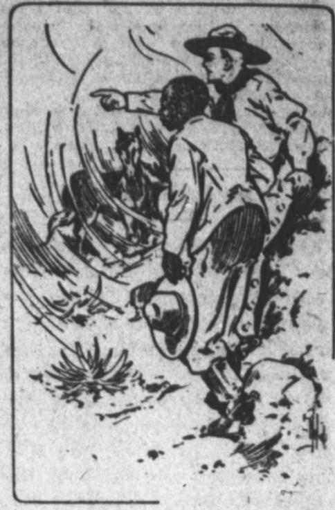
"Do You See That Straight Ahead of You?"