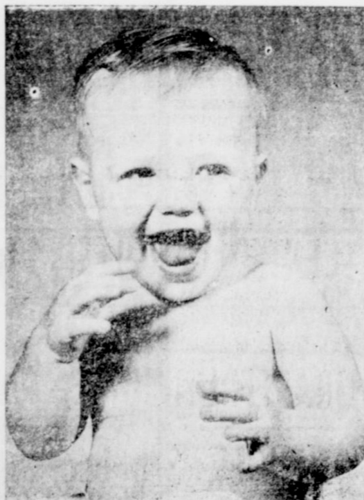
"Wonder if their auto loans department would finance my trike."