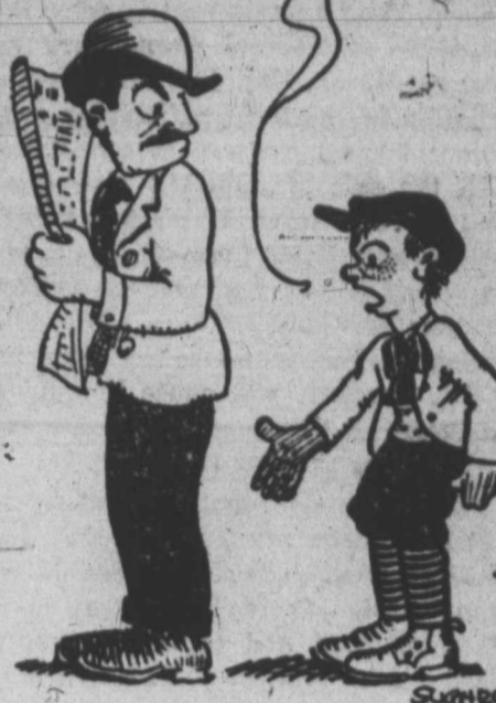
RANDALL COUNTY NEWS CANYON, TEXAS

LISTEN HERE, OLE TOP! YOU MAN MANAGE TO WIDDLE ALONG O.K. WITHOUT SUBSCRIBING PER TH' PAPER BY READIN' IT 'ROUND TOWN SOMEWHERE, BUT HOW 'BOUT VER WIFE? SHE LIKES TO READ TH' PAPER TOO!