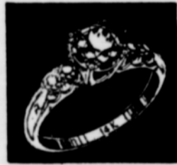
Stunning Engagement Ring. Large, brilliant cut center diamond; 2 side diamonds. White or yellow gold.