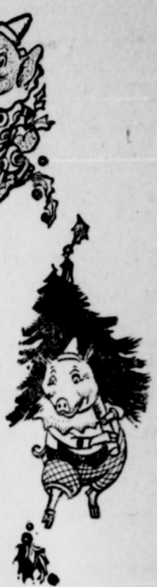
Kellogg's is in the RED and GREEN package!

FOR THIS WEEK ONLY—KELLOGG'S Jungleland is packed inside the Waxtite wrapper of every package of KELLOGG'S Corn Flakes! You can't buy KELLOGG'S without Jungleland—you can't buy Jungleland without KELLOGG'S!