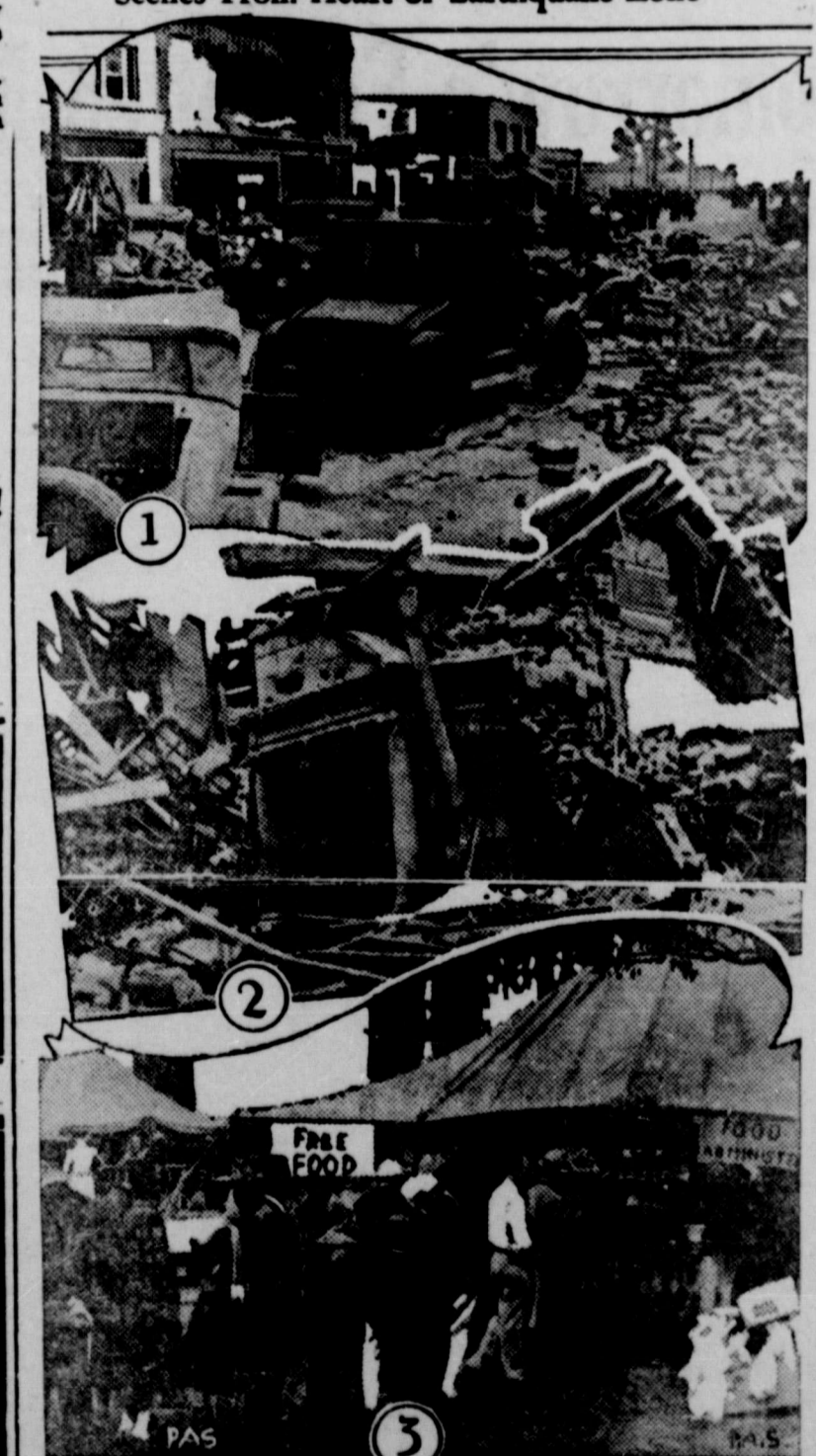
Here are photos from the heart of the earthquake zone which took 110 lives and did damage to property estimated at $50,000,000 in the Los Angeles area of Southern California. Photo No. 1 shows a street scene in Long Beach where 20 persons were killed by the collapse of building; No. 2, shows the ruins of a high school building in Long Beach, the town considered the quake's epicenter and where 55 lives were lost; No. 3, shows homeless and penniless refugees being fed by the U. S. Marines at Long Beach.