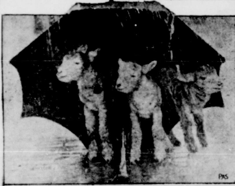
They were beautiful . . . and not dumb, this trio of young lambs which sought shelter as the April showers began to fall. An old umbrella in the yard caught their attention and, knowing what it was for, they calmly kept their tails dry. Spring, beautiful Spring.