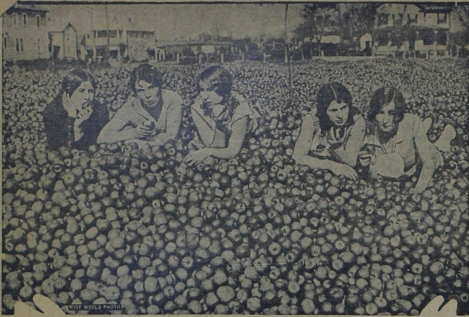
It is reported that the doctors of West Virginia are seeking new fields in which to practice, following a bumper apple crop in that state. Here five young ladies are shown with a section of the "mountain" of 70,000 bushels which are being canned at the rate of 7,000 bushels daily.