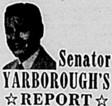
Senator YARBOROUGH'S REPORT

(This column, prepared by the State Bar of Texas, is written to inform—not to advise. No person should every apply or interpret any law without the aid of an attorney who is fully advised concerning the facts involved, because a slight variance in facts may change the application of the law.)