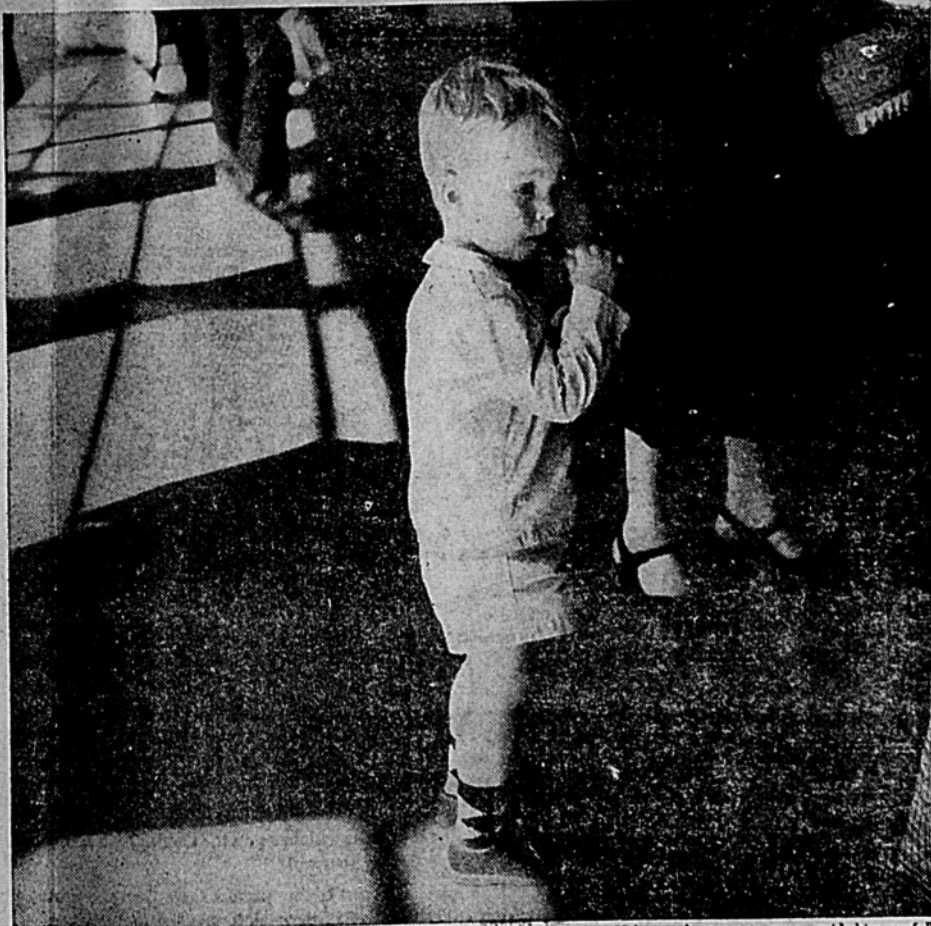
He's got a long way to grow - guide him carefully