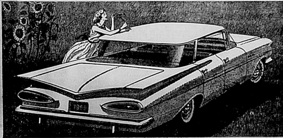
A new addition to Chevy's line—the beautiful Bel Air 4-Door Sport Sedan.

now—see the wider selection of models at your local authorized Chevrolet dealer's!