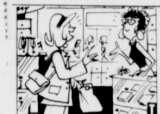
Thanking a salesperson after a purchase often results in more pleasant service to others.