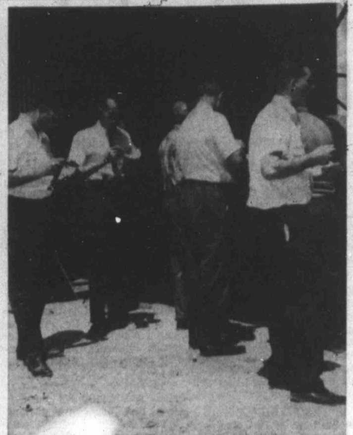
SAMPLING TASTY CANTALOUPE Most came back for seconds