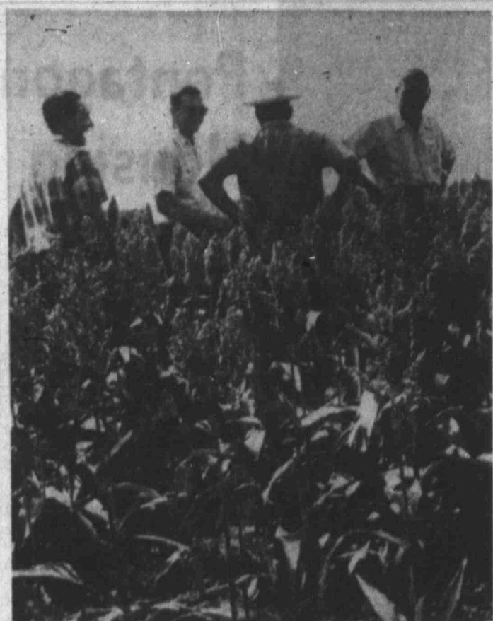
WAIST-HIGH GRAIN Visitors wade through it