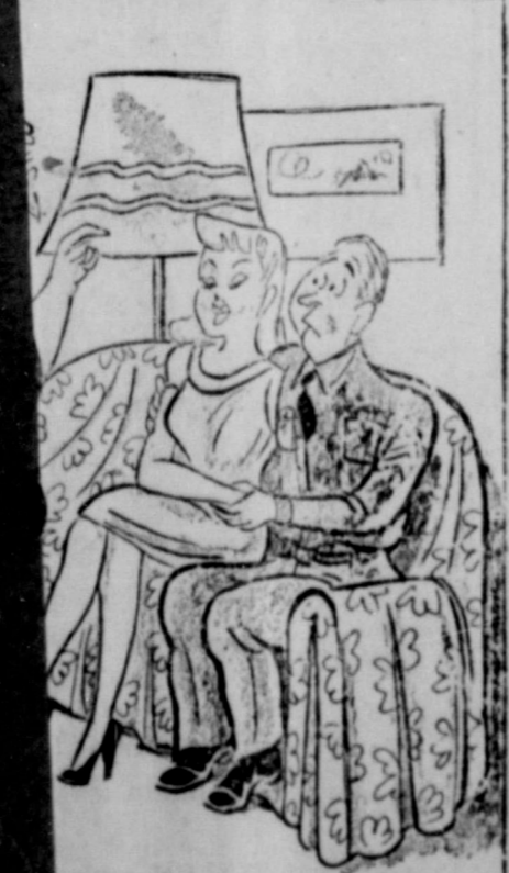
man—what time do you have to work tomorrow?"