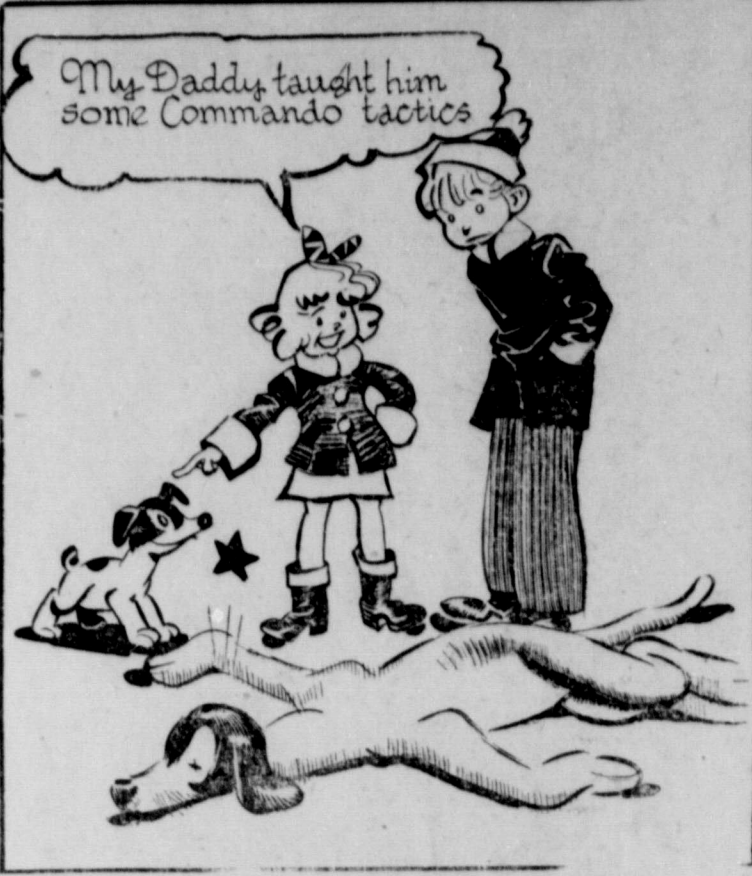
Well, Can Ya Tie That!