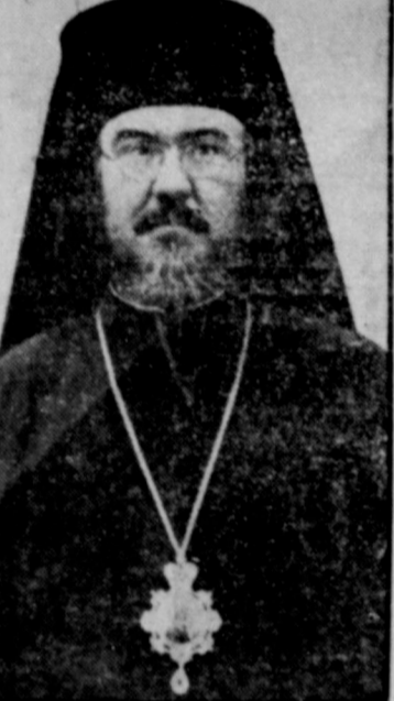
Archbishop Damaskinos is being mentioned in Greek government circles for the job of regent as a possible solution to civil strife.