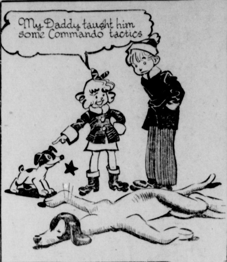
Well, Can Ya Tie That!