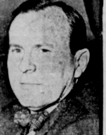
Lester B. Pearson is the new Canadian ambassador to the U. S. He likes to be called Mike.