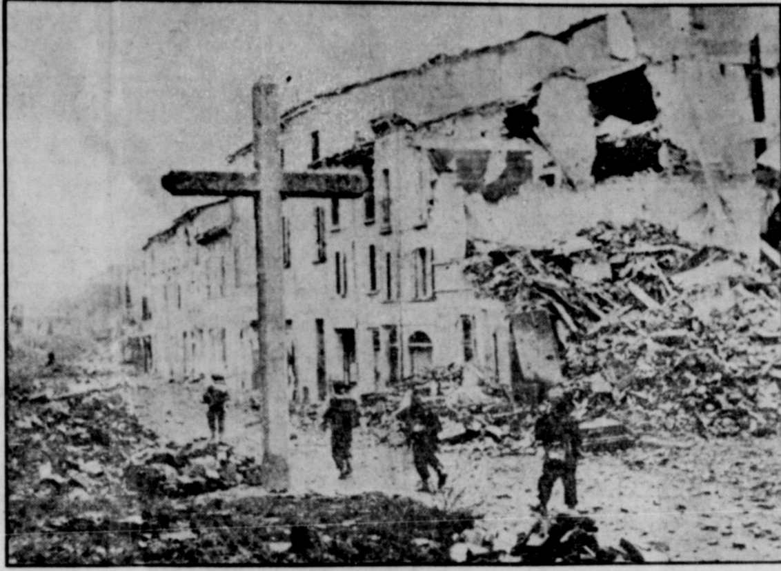
A cross that somehow withstood the pounding of artillery marks the entrance to Faenza, Italy, as New Zealand infantrymen tramp into the fallen city.